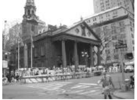
Scenes from A Pilgrimage to Ground Zero (Above Left) Working at the Message Banner; (Above Right) The Police Barricade Outside St. Paul's Church; (Below) Ashes Everywhere in the Churchyard and Debris Hung Up In the trees.